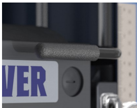
Built in Carriage Lock