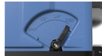
Built in Depth Stop